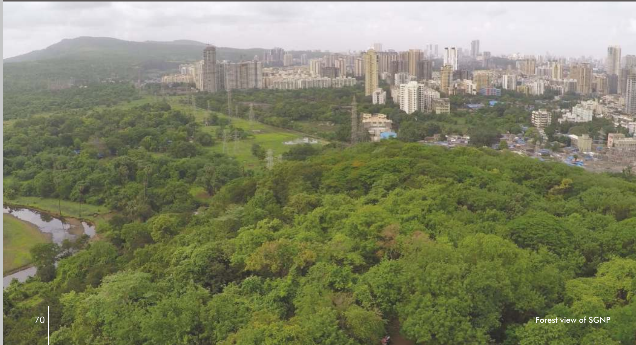
Forest view of SGNP