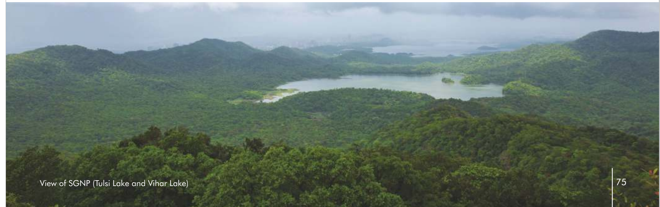
View of SGNP (Tulsi Lake and Vihar Lake)