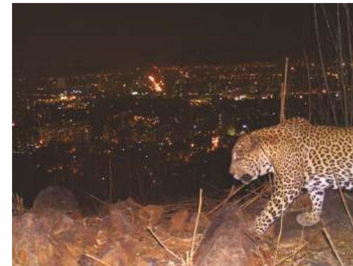
Common Leopard Panthera pardus

B orivali National Park is the miraculously preserved green oasis in the center of urban sprawl. This national park is "one of the very few" that is surrounded by a metropolis like Mumbai, yet sustaining sizable population of big cats like Panthers. It is hard to believe that the Park is within just less than an hour and half from Gateway of India, one is transported from hectic and fast life of Mumbai city to a serene and tranquil atmosphere of pleasing verdant wilderness. This city forest is remarkable because of its location and rich biodiversity it hosts. Besides, the forests of SGNP and surrounding forests are vital catchments as they supply drinking water to the city of Mumbai.