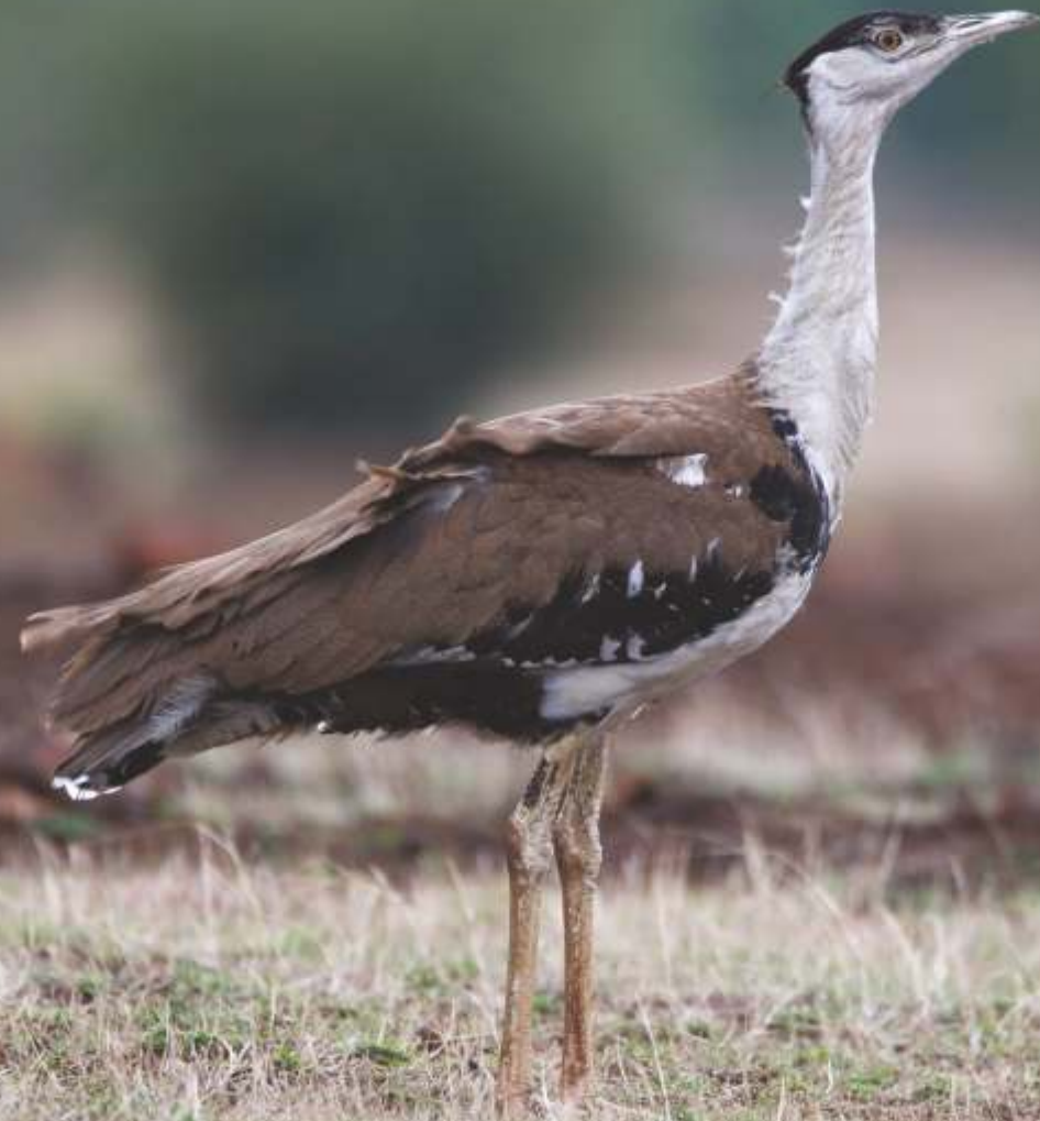
Great Indian bustard Ardeotis nigriceps

The Great Indian Bustard (Maldhok) is one of the rarest birds of Indian Sub-continent. The Bird is found only in some parts of Gujarat, Maharashtra, Rajasthan, Karnataka, Andhra Pradesh, and Madhya Pradesh States. The respective State Governments have declared the sanctuaries for the Great Indian Bustard. The Government of Maharashtra declared Great Indian Bustard Sanctuary in 1979 with the sole objective of conserving the rarest species of Great Indian Bustard which are endangered. The Sanctuary consists of the area of North Solapur, Madha, Mohol and Karmala Talukas of Solapur District and Karjat, Shrigonda, Newasa Talukas of Ahmednagar District covering a total area of 8496.44 sq.km. This bird has been included in the Schedule-1 of Wildlife Act 1972 and accordingly due protection has been given to this bird. The headquarters of the Sanctuary are Nannaj of Solapur District and Rehekuri of Ahmednagar District. The area of the Sanctuary is being reorganized in an effort to effectively protect the species. Studies using ringing GPS based telemetry are on process.