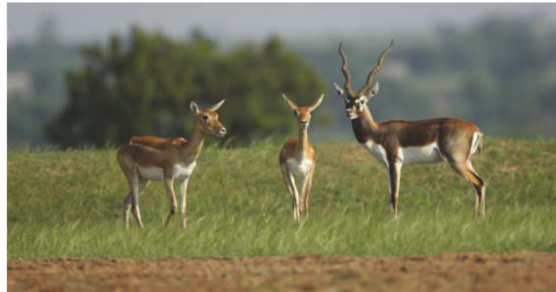
Blackbuck Antelope cervicapra

The Great Indian Bustard Ardeotis nigriceps is one of the rarest birds of Indian subcontinent. It is a large ground dwelling bird with a long neck and long bare legs and somewhat similar to a young Ostrich. Its standing height is more than a meter; wing span is 2.5 meters and weighs about 18 kg. It is an inhabitant of the open country having thorny bushes and tall grass interspersed with cultivation. It is omnivorous in diet mainly relying on grass, small shrubs, insects, rats, chana, groundnut, bajri etc. depending on the season. The male is deep sandy buff coloured. The crown of the head is black and crested. In the female which is smaller than the male, the head and neck are not pure white and the breast band is either rudimentary or absent. The male is polygamous. The female lays only single egg once in a year. Since these birds do not live in nests, the eggs are at risk of destruction from other animals.