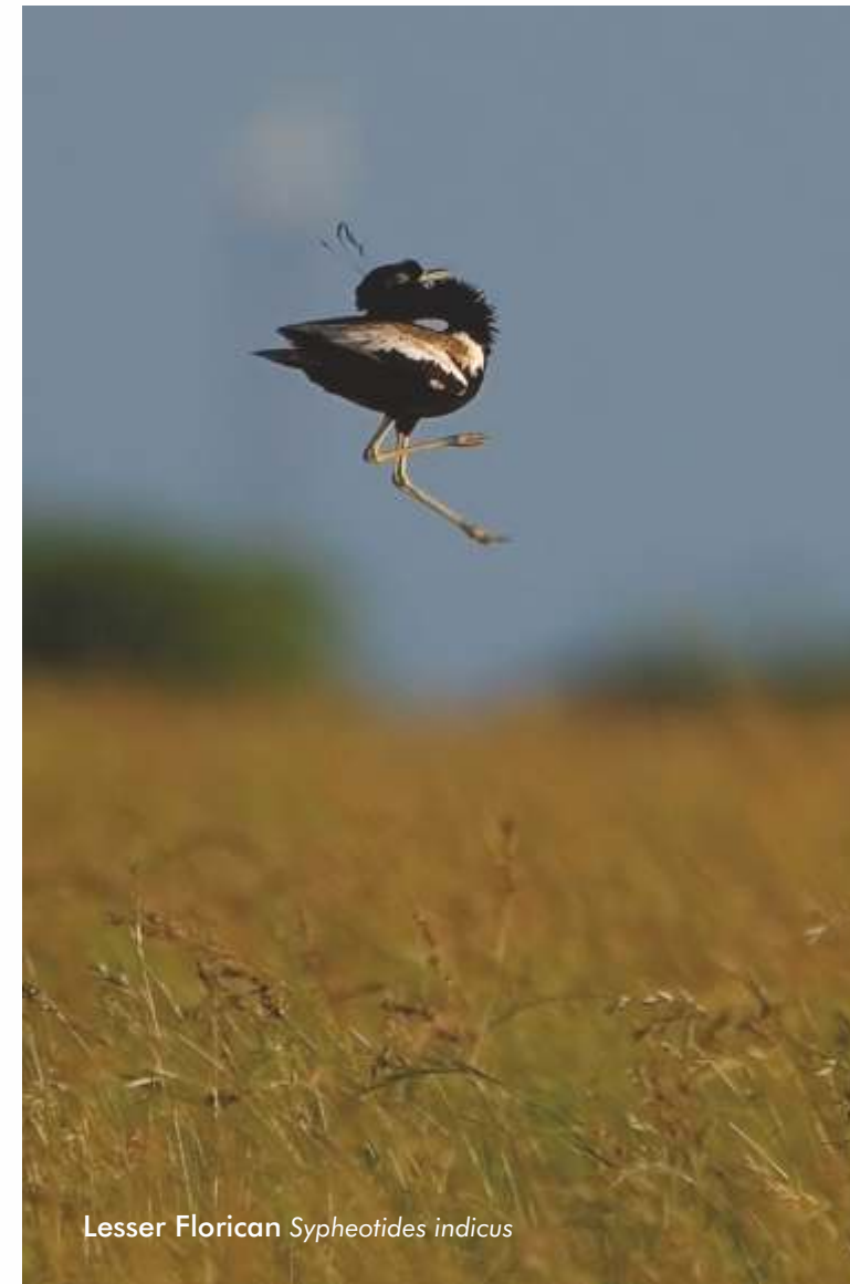
Lesser Florican Sypheotides indicus

How to reach : By Air : Nearest airport Pune By Rail : Solapur 25 kms. By Road : 10 ksm. from offshoot on Solapur-Pune NH