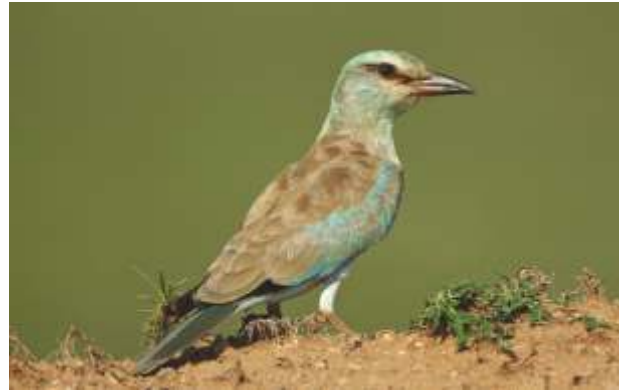
European Roller Coracias garrulus