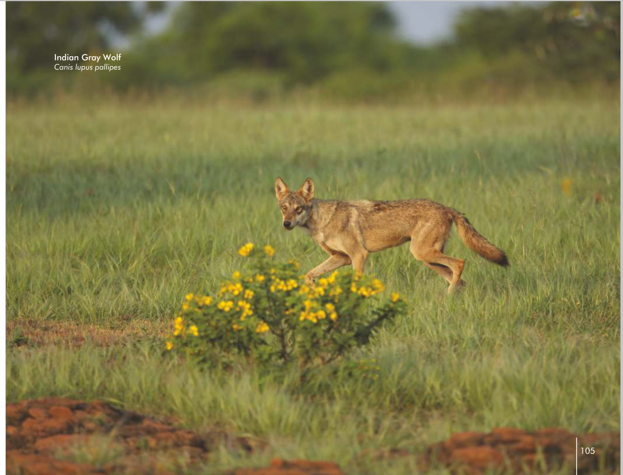
Indian Gray Wolf Canis lupus pallipes